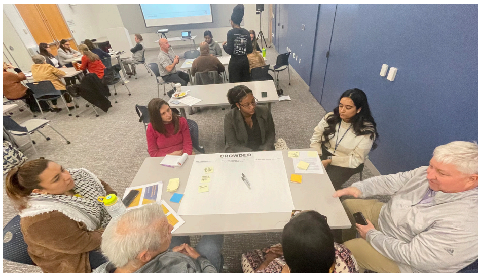
2024 Meeting of the Alexandria Healthy Homes Network